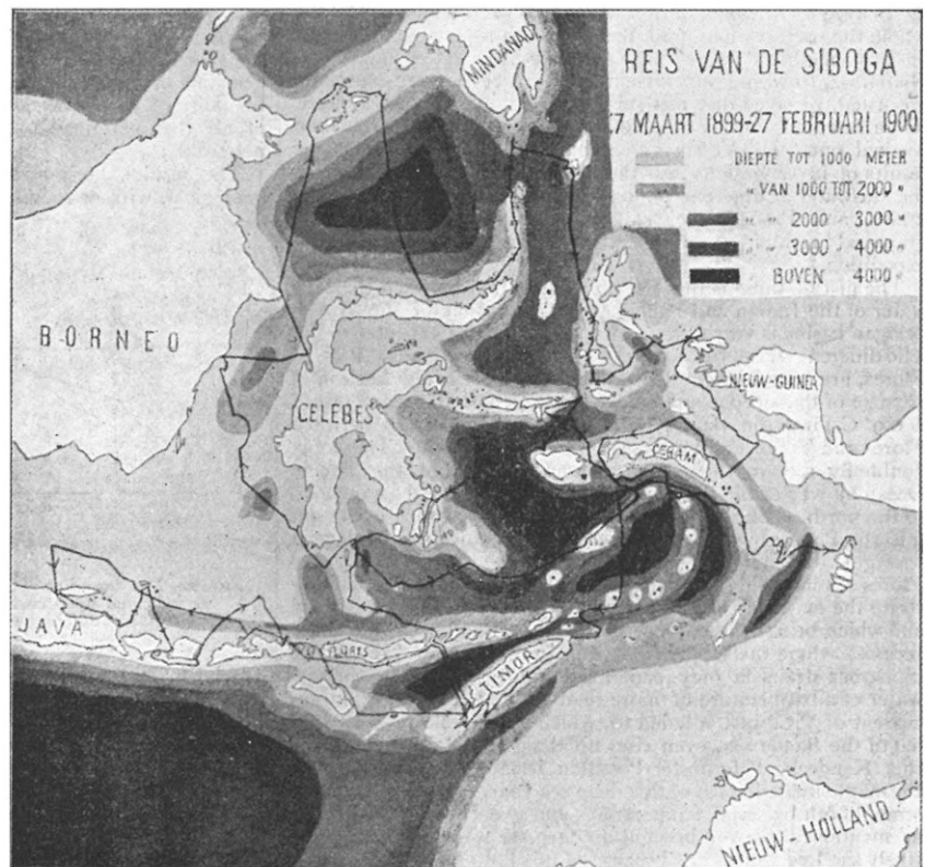
FIG. 1.—Track of the Siboga .

panied by Madame Weber-van Bosse, herself an accomplished naturalist, who made a very complete collection of Algae during the cruise, and who settled three very important points as a result of the observations made, viz. : (1) the presence in unexpected quantities of calcareous Algae (Lithothamnion) in the Archipelago, so that they build up reefs of considerable dimensions, in depths of 3 to 40 metres, in one case even at 120 metres. Different circumstances of level, current, &c., must co-operate to render the occurrence of Lithothamnion in such quantities possible: the expedition found them realised in at least thirty different localities, and henceforth the possible contribution of Lithothamnion-remains to the formation of the earth's crust will in many cases have to be reconsidered by the geologists. (2) The presence of a minute vegetal organism about which of late years English and German naturalists have considerably differed in opinion: the Coccosphere. Neither the members of the German Plankton nor those of the Valdivia expedition have succeeded in satisfying themselves that these miniature spheres with adherent discs of lime, already known in the Cretaceous